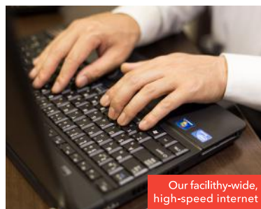
Our facility-wide, high-speed internet

All of our hotels are equipped with Wi-Fi internet access. You can connect to the Internet with a game machine by using Wi-Fi.