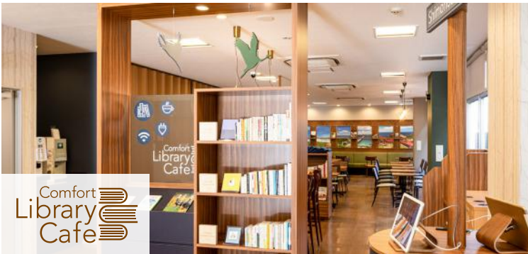
Comfort Library Cafe

Available to all guests free of charge this space offers unlimited free tea, coffee and other beverages as well as a variety of reading materials for your enjoyment, such as travel books and photo books about local culture.