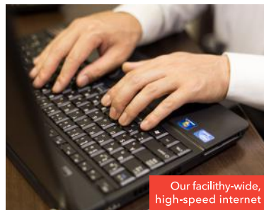
Our facility-wide, high-speed internet

All of our hotels are equipped with Wi-Fi internet access. You can connect to the Internet with a game machine by using Wi-Fi.