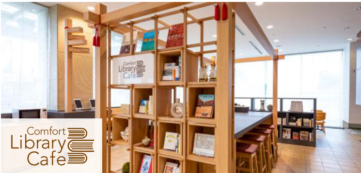
Comfort Library Cafe

Available to all guests free of charge this space offers unlimited free tea, coffee and other beverages as well as a variety of reading materials for your enjoyment, such as travel books and photo books about local culture.