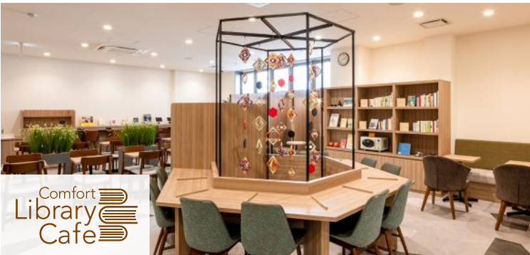
Comfort Library Cafe

Available to all guests free of charge this space offers unlimited free tea, coffee and other beverages as well as a variety of reading materials for your enjoyment, such as travel books and photo books about local culture.